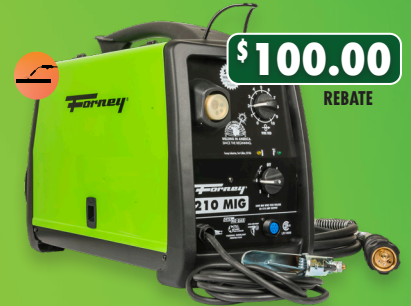
210 MIG WELDER ITEM# 311