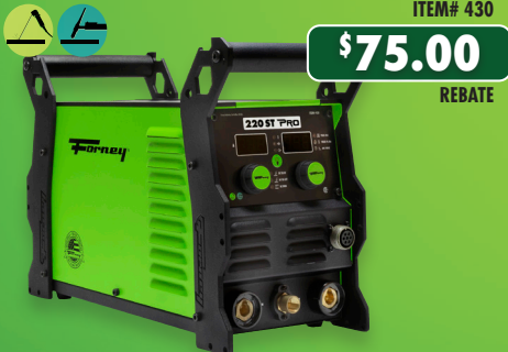
220 ST PRO WELDER ITEM# 430