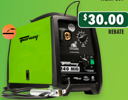
140 MIG WELDER ITEM# 309