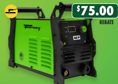
40 P PLASMA CUTTER ITEM# 440