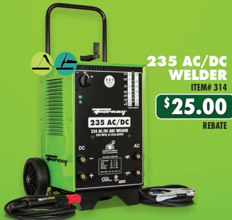
235 AC/DC WELDER ITEM# 314