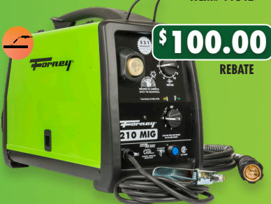
210 MIG WELDER ALUMINUM PACKAGE ITEM# 11342