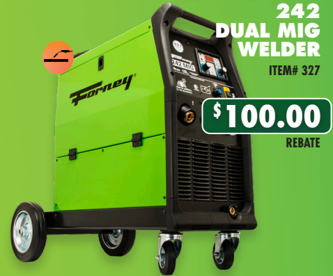
242 DUAL MIG WELDER ITEM# 327