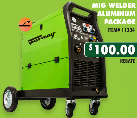
242 DUAL MIG WELDER ALUMINUM PACKAGE ITEM# 11334