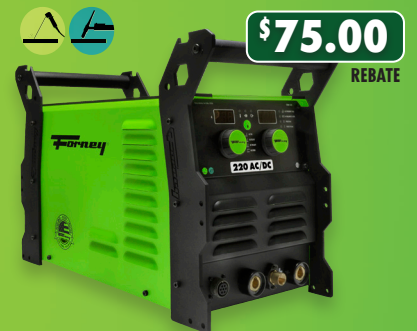
220 AC/DC TIG & AC/DC TIG AMP TROL WELDER ITEM# 420 & 421