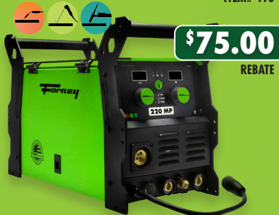
220 MULTI-PROCESS WELDER ITEM# 410