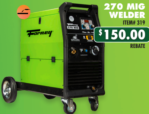
270 MIG WELDER ITEM# 319