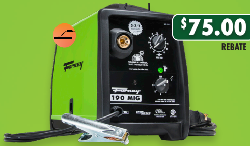
190 MIG WELDER ITEM# 318